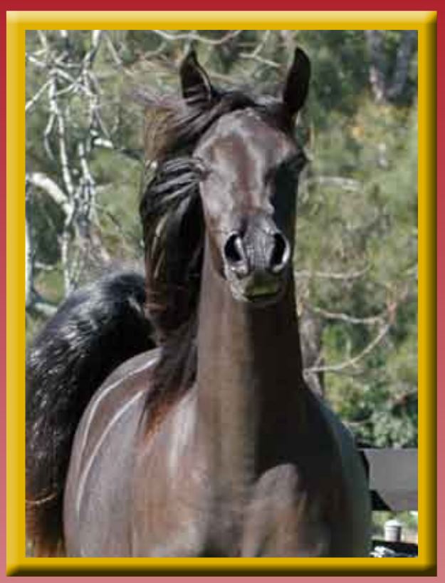
Simeon Shaddai, as a yearling due to foal to Asfour

Simeon Simona was never shown as are most of Simeon horses