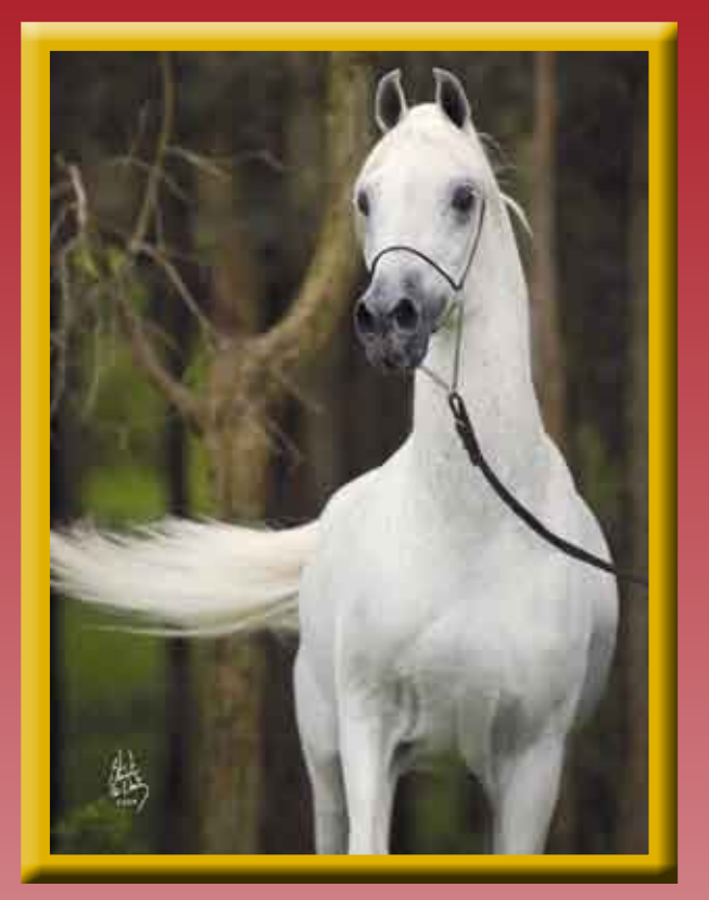
Asfour, sire of Simeon Simona photo taken in april at 25 years of age

The straight egyptian, Simeon Simona was a truly great Arabian mare, well over 15h.h. elegant with a long fine neck, amazing moverment and unforgetable, huge black eyes combined with the wonderfull dispossion of her dam.