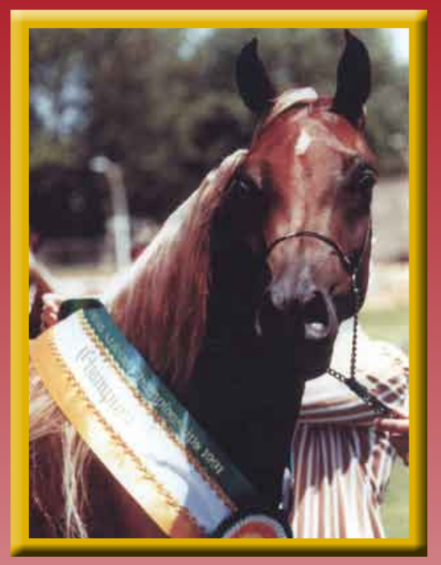
Simeon Sukari Australian champion mare, only full sister to Simeon Simona